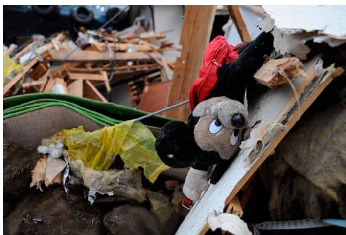
OFUNATO, Japan (March 15, 2011)