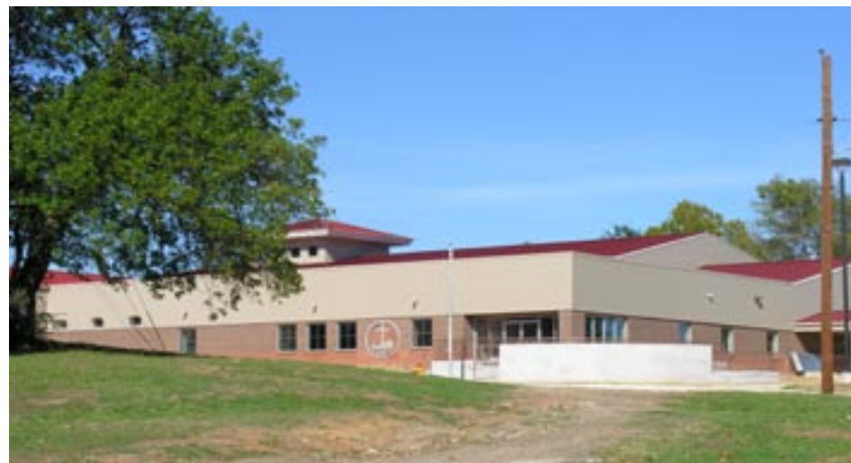
Exterior view of the new women and children facilities near downtown.

It is vital that the community realizes its part in this servant-hood and thus the success of these two shelters. Eighty to ninety percent