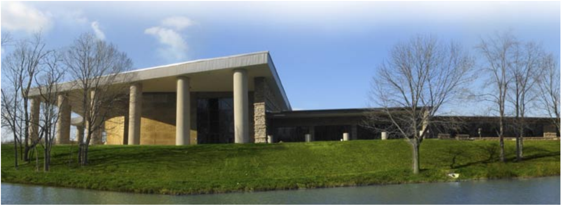
Above photo: Outside the Creation Museum near Cincinnati, OH. Below right: The lobby of the museum. Bottom right: The front entrance.