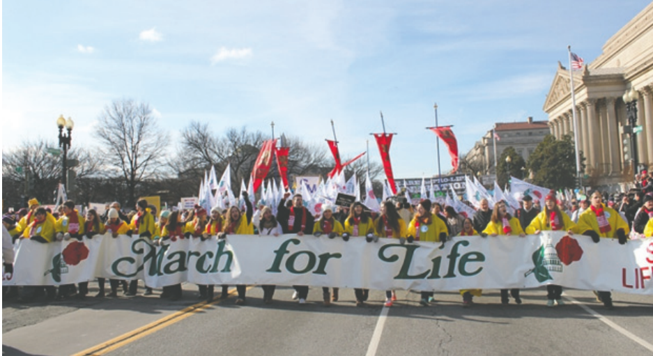
Washington, D.C. March for Life

While no exact #'s have yet been reported, it is believed that tens of thousands turned out for the Jan. 22 March for Life in Washington, DC. commemorating the 42nd anniversary of Roe vs Wade. Among those attending, and for pro-lifers around the country, there was great disappointment and disgust from some, that the Pain Capable Unborn Child Protection Act did not go to the floor of the House as it was originally scheduled to – on the same day as the March. But in turn many were pleased and excited to know that the No Taxpayer Funding Abortion Act did pass through the House that day enabling it to go on to the Republican controlled Senate. That in itself is a good move forward.