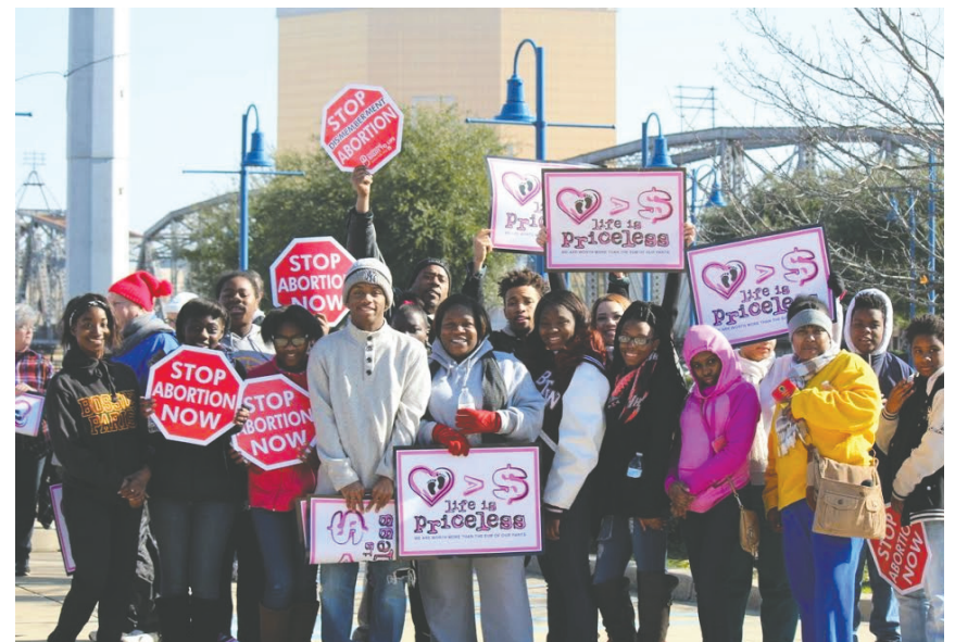
Local marchers in Shreveport from Community Renewal