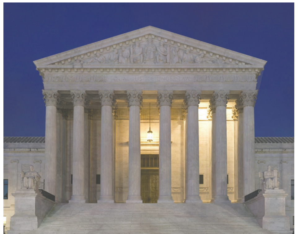
United States Supreme Court