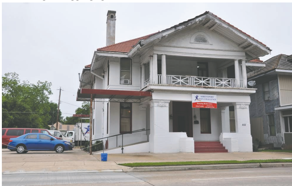
The Shreveport Center at 452 Stoner - needing some restoration.

Sometime after this, Rev. Wilkerson resigned his church in Pennsylvania and moved to New York to work full time with teenage gangs. His work compelled him to write the popular book, "The Cross and the Switchblade." This ministry was eventually called "Teen Challenge," and soon it began to offer help to those addicted to drugs and alcohol. Residential centers began cropping up all across America.