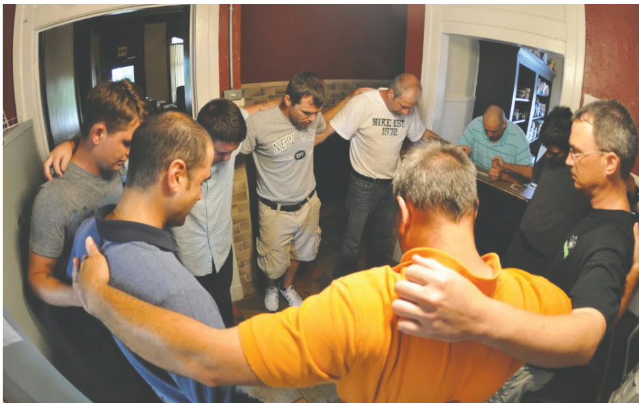
Residents pray before their meals together.

“Back then I was praying for God to give me strength, now I’m praying that God IS my strength.” He encourages other addicts. “It is much easier