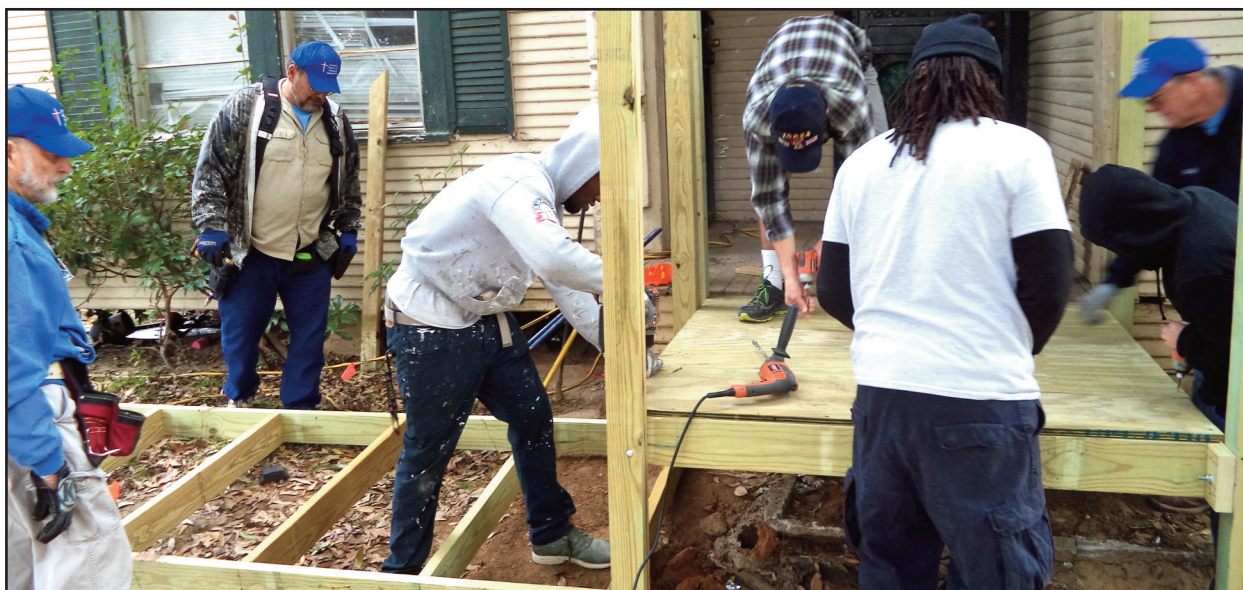
Above: AmeriCorps team members work with the North Highlands United Methodist Church's ramp-building group.