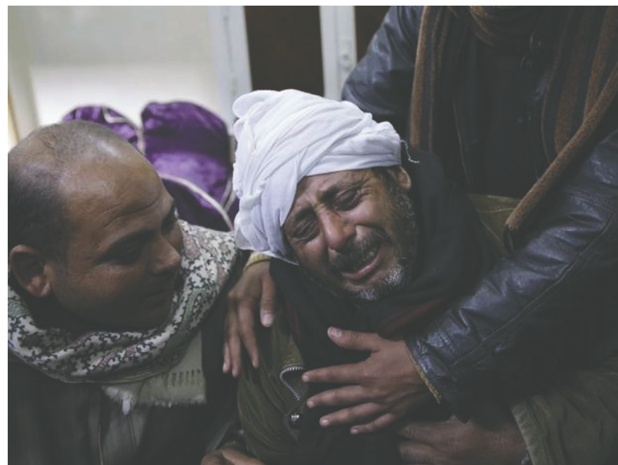
13 young men from el-Aour were among 21 Christians dragged off by militants in Libya in December and January.

Visit https://focusonthefamily.webconnex.com/co-persecutedchurch2015 to download a free copy of "Talk to your Kids about the Persecuted Church"