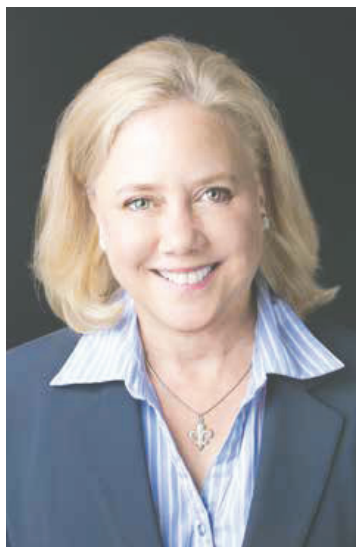
Bill Cassidy (R) Candidate for Senate