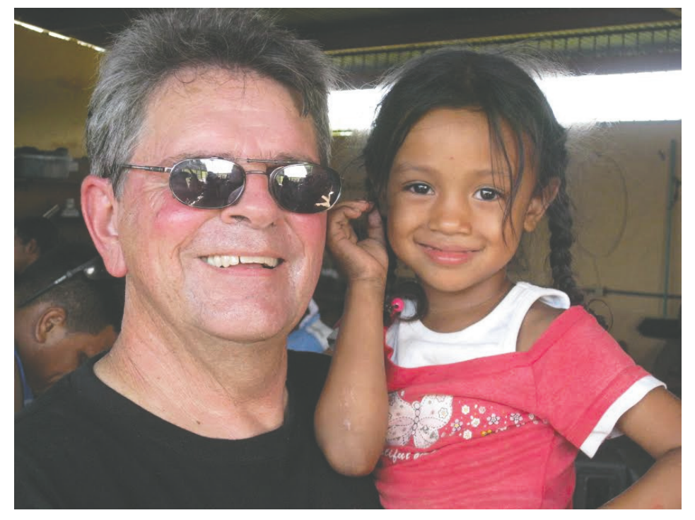
My new friend

CMA is an organization made up of teams of members working together to accomplish much for the Kingdom of God. More information about CMA, Run for the Son, Seasons of Refreshing conferences, state rallies, and national rallies is available on our website, <u>www.cmausa.org</u>. Love to ride motorcycles? Love the Lord Jesus Christ? Check out our website and find a local CMA chapter and get involved. It will be the ride of your life!